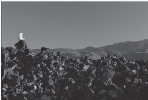
Art by Sergio Bustamante

And yet he survived the winter, and seemed improved with the first sunny days. At the beginning of December some large, stiff feathers began to grow on his wings. He must have known the reason for the changes. He carefully made sure that no one noticed them. One morning a strong wind blew into the kitchen. Elisenda went to the window and saw the angel clumsily trying to fly. He managed to take off. Elisenda let out a sigh of relief when she saw him pass over the last houses. She kept watching until she couldn't see him. Then he was no longer an annoyance in her life but an imaginary dot over the sea. F G